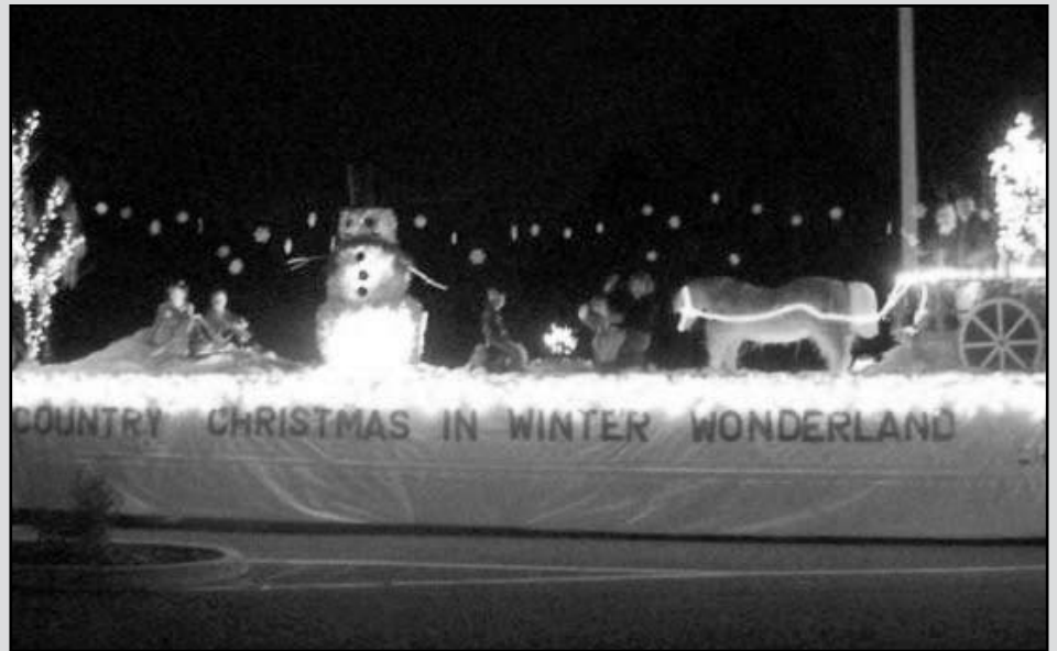
Farmers Cooperative 1st Place Winner