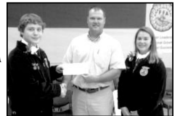
Middle School FFA