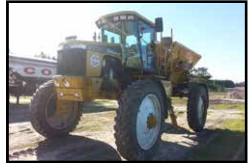
RoGator Variable rate applicator