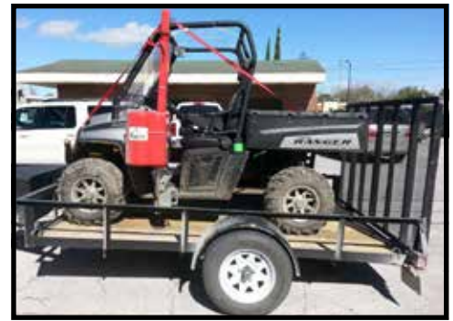
Precision Soil Sampling ATV

Farmers Cooperative is committed to serving our farmers with all that precision agriculture has to offer. If you have any questions, feel free to contact one of our precision ag teammates.